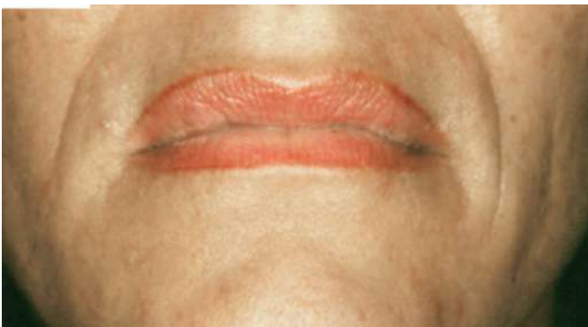
Figure 3: Photograph of the patient in 2001 before any treatment. Note the deep nasolabial lines and other signs of severe photodamaged skin.

I wanted to reduce the patient's photodamaged skin condition further and encouraged her several times to have fractional CO2 laser treatments, but she was afraid of the treatment and could not afford the long downtime period that was needed. I lost contact with the patient in 2009 for a few years when she had to move to southern Spain due to her work.