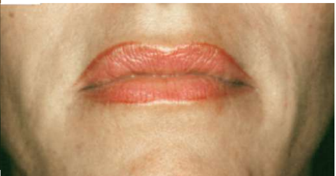
Figure 4: Photograph of the patient in 2001 immediately after the injection of hyaluronic acid dermal fillers into the nasolabial folds.

We reconnected again in August 2016 when she moved back to South Wales and was planning for her wedding. However, the patient's health had changed as she was diagnosed with rheumatoid arthritis and was receiving regular methotrexate injections and occasional oral corticosteroids. Her skin had deteriorated further due to both age and more sun exposure in Spain. I graded her skin then as severely photodamaged (Glogau stage 4) ( Figure 5 ).