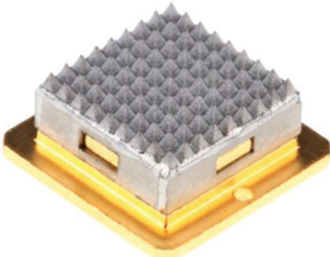
Figure 1: Tixel treatment tip with titanium arrays of pyramids to create the fractional treatment.

I believe the idea for inventing TMA came after Choi et al in 1999 published a study that suggested that when a CO 2 laser hits the skin surface, it will heat the skin to around 400°C. 5 Thus, in theory, if another treatment modality can heat the skin to a similar temperature, it could deliver the same results as the ablative CO 2 laser. In 2012, Slatkine et al published an article on a device they invented that used small metal rods that were heated to 400°C to create a microthermal zones (MTZ), that histologically was like those made by a fractional CO 2 laser. 6 This device, which was the precursor to the Tixel, then went through an extensive redesign to make it safer and more efficient.