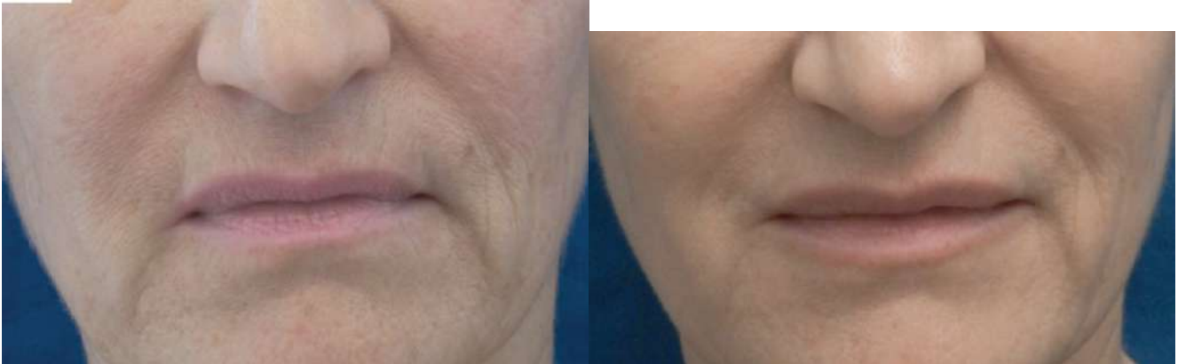
Figure 5: Photograph of the patient in August 2016, before any treatment. Note the signs of advanced photo damaged such as wrinkles all over, dull and loose skin.

The patient came back again in October 2016 and we discussed the new Tixel treatment as an option for her. She liked this suggestion and decided to go ahead with the treatment.